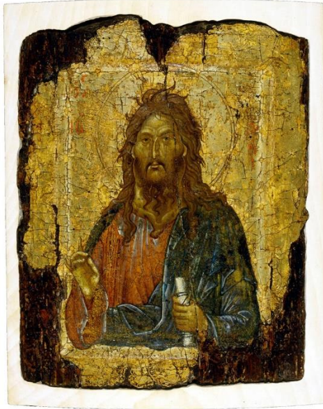
Icon of John the Baptist c. 1300 – Museum of Russian Icons