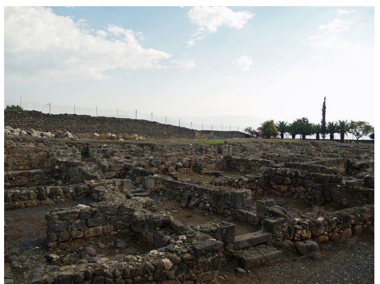
Ruins of Capernaum from Roman times

Evangelical Lutheran Church in America God's work, Our hands.